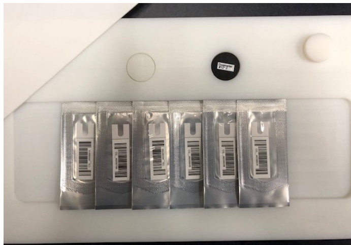
FIGURE 2: B3 dosimeters overlapping edges (with alanine dosimeter)