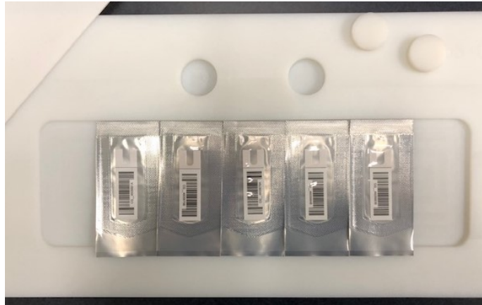
FIGURE 1: B3 dosimeters spaced edge to edge